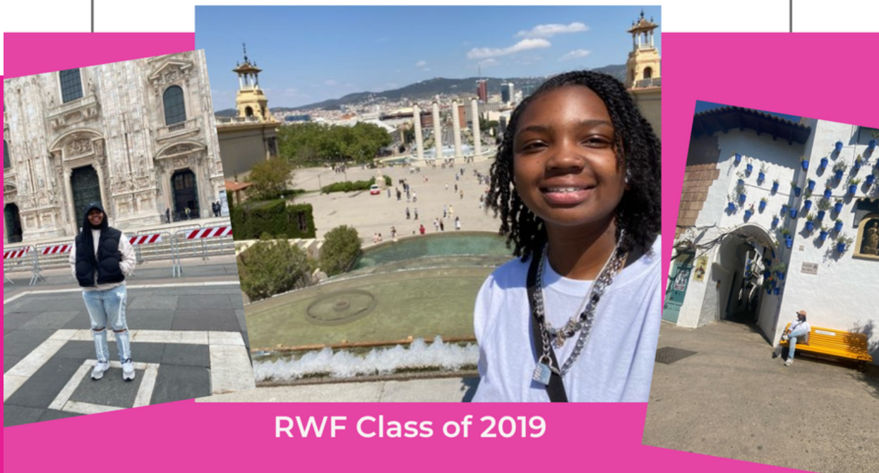
RWF Class of 2019