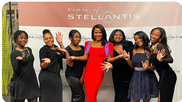
RWF Teens serve as hostesses for the Women of Stellantis Gala