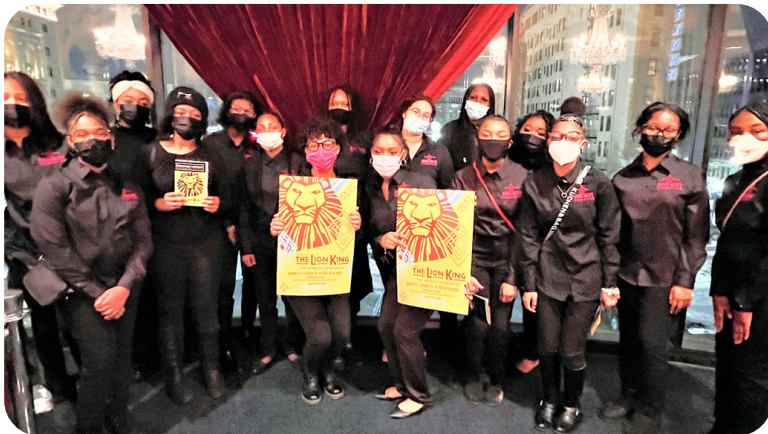
RWF Teens and Mentors enjoy a night at the theater thanks to Broadway in Detroit!